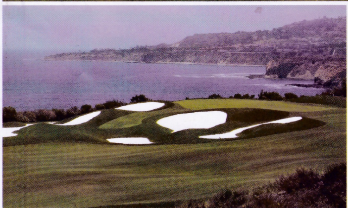
With ocean views and multi-million-dollar waterfalls, Trump National is sure to make a splash.