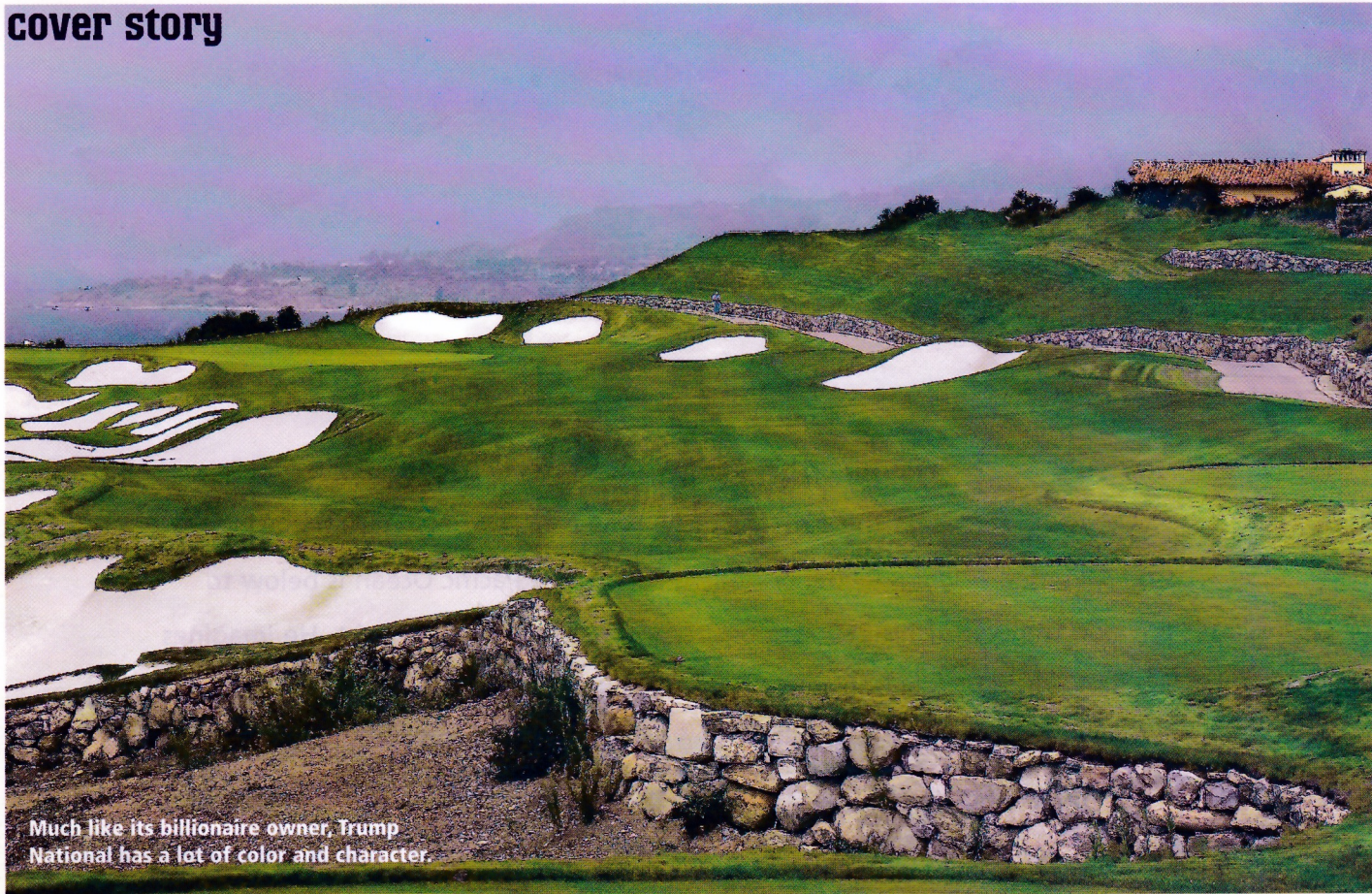
Much like its billionaire owner, Trump National has a lot of color and character.